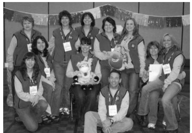
Special Smiles volunteers