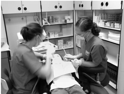
Apollo dental hygiene students placing sealants on a second grade student in a classroom that was converted into a new preventive dental clinic at Meridian Elementary School.

The Juniors will be taking the WREB anesthesia exam in May.