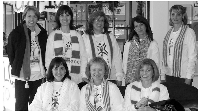
Some Special Smiles volunteer dental hygienists

These Winter Games will be remembered by moments of gratitude and giving from pure hearts, not only from the athletes themselves, but from numerous dedicated volunteers. Special Smiles had 262 volunteers from Idaho: 30 Dentists, 78 Dental Hygienists, assistants, students and many others. Special Smiles also had the privilege of hosting 25 dentists and dental hygienist from 20 different states in the USA and 15 dentists and dental hygienists from 15 different countries! Thank you all who participated and dedicated your time to helping Special Smiles change the lives of so many Special Olympic athletes from around the world.